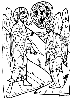
·JESUS EXPELS THE DEMONS·