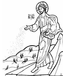
THE SOWER OF GOOD SEEDS:

lacked moisture. And some fell among thorns, and the thorns sprang up with it and choked it. But others fell on good ground, sprang up, and yielded a crop a hundredfold. When He had said these things He cried, "He who has ears to hear, let him hear!" Then His disciples asked Him, saying, "What does this parable mean?" And He said, "To you it has been given to know the mysteries of the kingdom of God, but to the rest it is given in parables, that 'Seeing they may not see, And hearing they may not understand.' Now the parable is this: The seed is the word of God. Those by the wayside are the ones who hear; then the devil comes and takes away the word out of their hearts, lest they should believe and be saved. But the ones on the rock are those who, when they hear, receive the word with joy; and these have no root, who believe for a while and in time of temptation fall away. Now the ones that fell among thorns are those who, when they have heard, go out and are choked with cares, riches, and pleasures of life, and bring no fruit to maturity. But the ones that fell on the good ground are those who, having heard the word with a noble and good heart, keep it and bear fruit with patience.